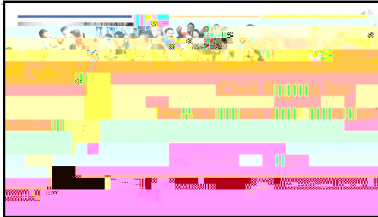
Civil Rights for Newcomers and Immigrants